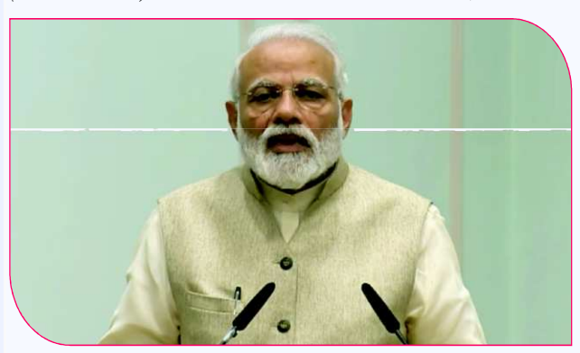
Hon'ble Prime Minister Shri Narendra Modi Ji addressing the gathering.

It is matter of great pride that the Hon'ble Prime Minister of India, Shri Narendra Modi ji released the complete set of 5 volumes of the project titled Dictionary of Martyrs: India's Freedom Struggle (1857-1947) at his official residence, 7 Lok