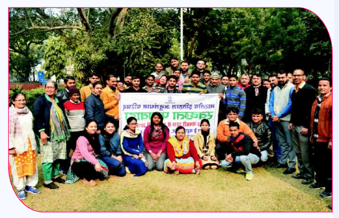
ICHR Officials participating in Swachhta Pakhwada.

Swachhata Pakhwada: There was a campaign for Swachhta Pakhwada from 14-31 January 2019. The staff members of the Council took part in it.