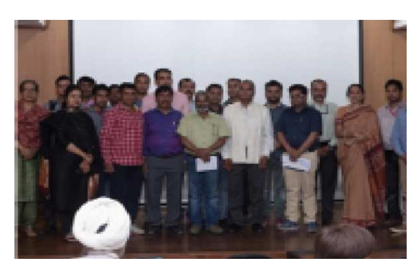
Delegates, Participants, ICHR Officers and staff during the closing session.